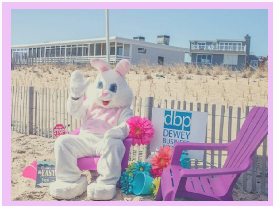
April 8th is the Dewey Egg Scoop on Van Dyke Bay Beach!